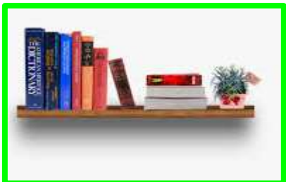
1. There are some books on the bookshelf.

En esta actividad te proponemos repasar algunas preposiciones de lugar (in-on-under-between) que sirven para describir la localización de personas y objetos. Mira las imágenes y lee las descripciones mientras escuchas el audio en este enlace audio clase 5 actividad 2 prepositions.mp3 . Puedes leer en voz alta para practicar la pronunciación y puedes pausar el audio si es necesario!.