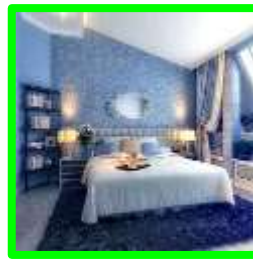
2. There is a blue carpet under the bed.