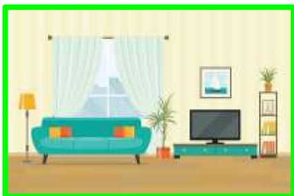
3. There are two plants in the living room.